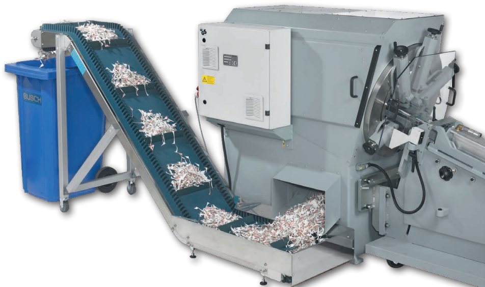
BUSCH Waste Conveyor model KF 110 connected to a BUSCH Die-Cutting Machine model BL