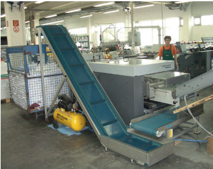
BUSCH Waste Conveyor model KF 175 with HF 00 on a Heidelberg Stitchmaster