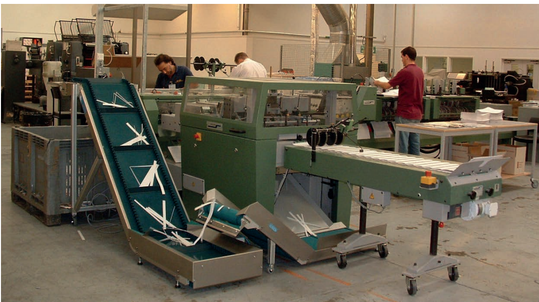
BUSCH Waste Conveyor model KF 145 with HF 35 on a Müller Martini Minuteman